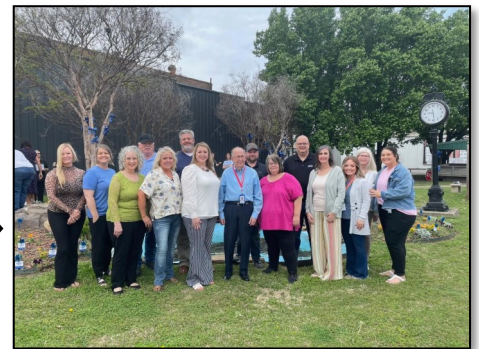
→ Employees from the Board & Administration office in Stigler attended the Ribbon Cutting ceremony at Veterans Park in Stigler on April 1st. This ceremony kicked off Child Abuse Prevention Month.