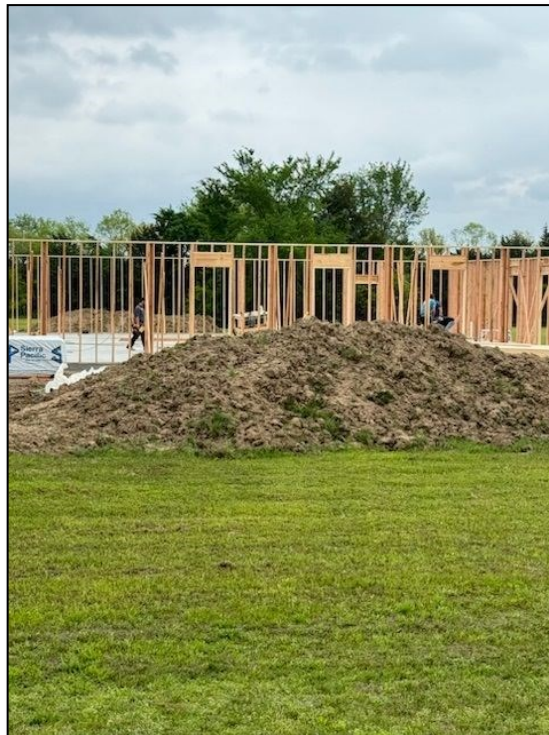
The foundation is poured and walls are being erected at the new Work Ready Oklahoma Employment Center in Poteau. Construction is due to be completed by late Summer.

A brand-new facility next door to our LeFlore County office is currently in construction. Staff is being pursued to fill four administrative jobs. It's a very exciting time.