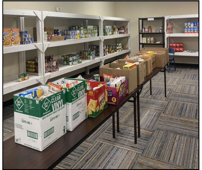
The Latimer Food Pantry received 1,700 cans of donated food, along with cases of ramen noodles, beans, and rice, from a food drive coordinated by the Latimer County Sheriff's Office through all schools in Latimer County.