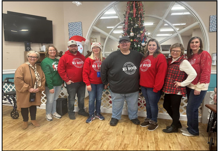
Several staff members from KI BOIS Central Office sang Christmas carols to the residents at the Haskell County Nursing Center in Stigler today. What a blessing it was.