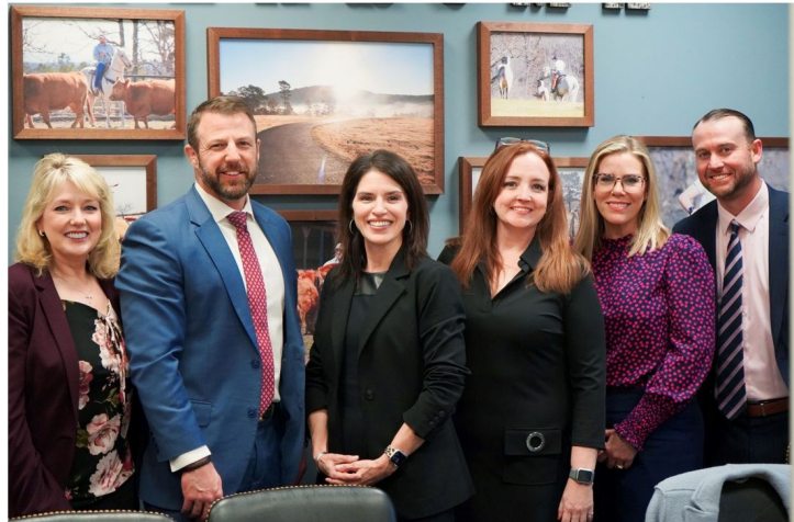
We also welcomed the Oklahoma Transit Association to the office this week. We discussed what an achievement it is that Oklahoma public transit agencies serve all 77 counties in Oklahoma, as well as the challenges these agencies face in doing so.