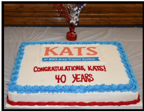
KATS’ 40th Year was celebrated at the September Board Meeting. 1983 — 2023