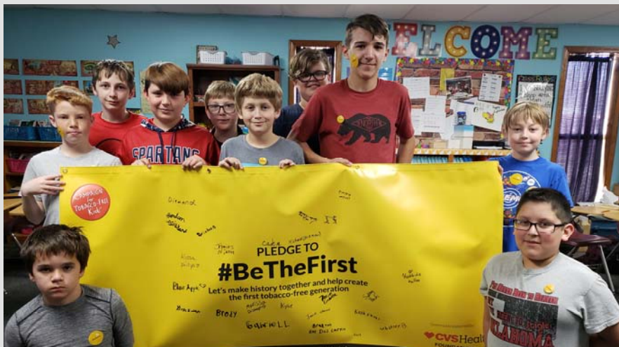
Whitefield Students make a pledge to "Be the First Tobacco Free Generation."

In Haskell/Latimer county, the Healthy Living Program / TSET visited schools and events to spread the information on how big tobacco companies target elementary and middle school students. KIDS LIKE CANDY AND BIG TOBACCO NEED NEW CLIENTS. With 1200 deaths a day in the US, big tobacco companies need replacements clients. Big tobacco spends $1,000,000.00 an HOUR on advertisement to draw in KIDS to the addiction of tobacco, that is why vaping pens and PUFF BARS come in flavors that are pleasing to elementary grades. For more information call 1800-QUITNOW or https://