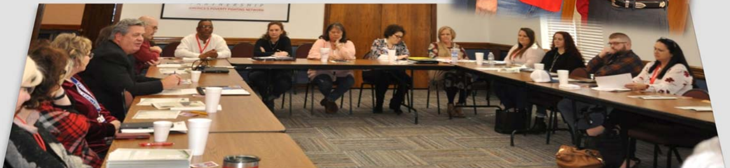
Just a few of the many faces who attended staff meeting on February 14th, 2020