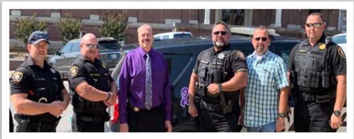
The McAlester Police Department shows their support for Domestic Violence Awareness Month