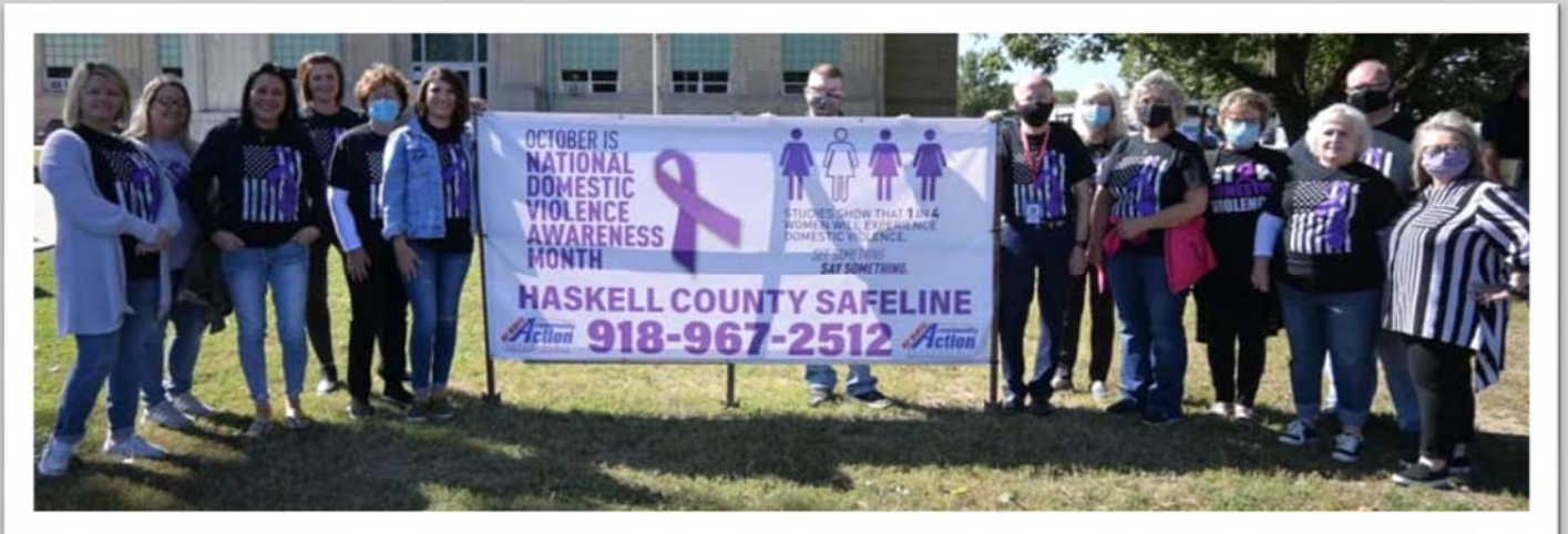
KI BOIS Community Action Haskell County staff show their support for the Domestic Violence Awareness event.