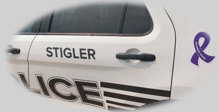
Stigler Police Department shows support for Domestic Violence Awareness Month.