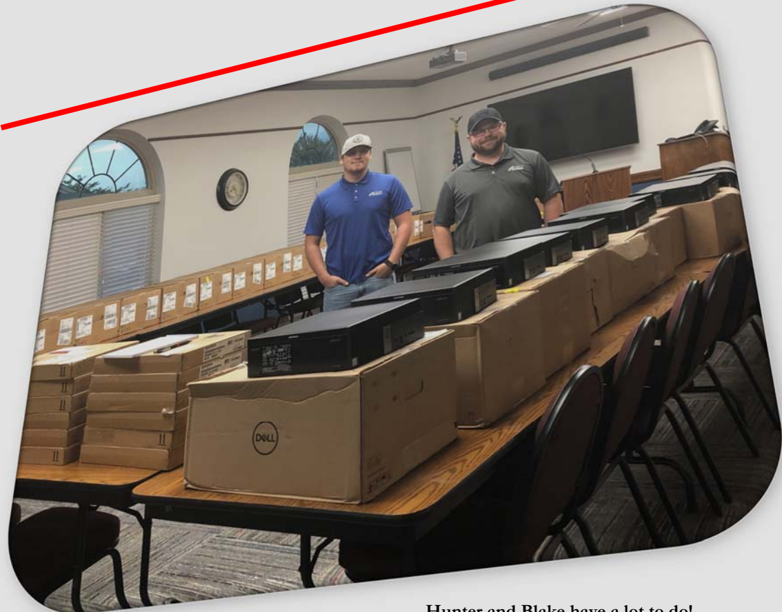
Hunter and Blake have a lot to do!

Also beginning FRIDAY, JULY 17TH, 2020, all customers riding KATS vehicles will be required to wear a MASK or FACE COVERING that completely covers your nose and mouth. Placing your face inside your shirt is not acceptable.