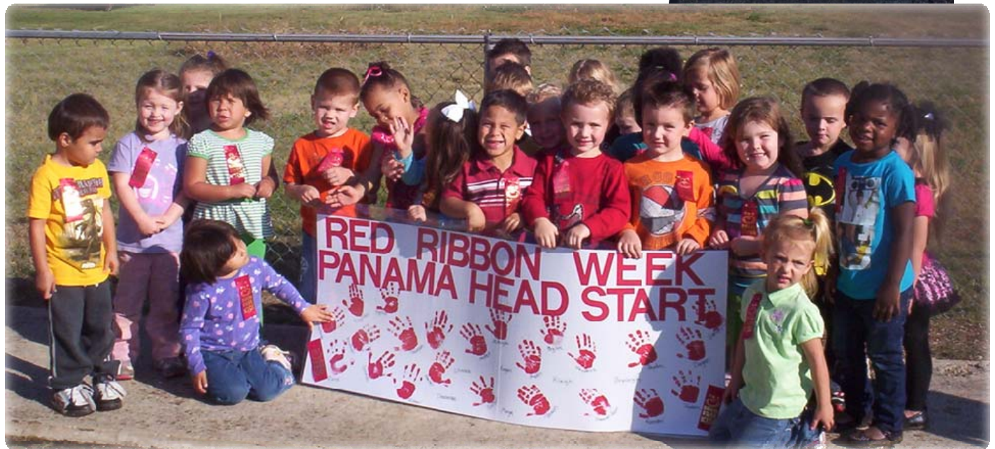
Panama Head Start celebrates Red Ribbon Week and Head Start Awareness Month.