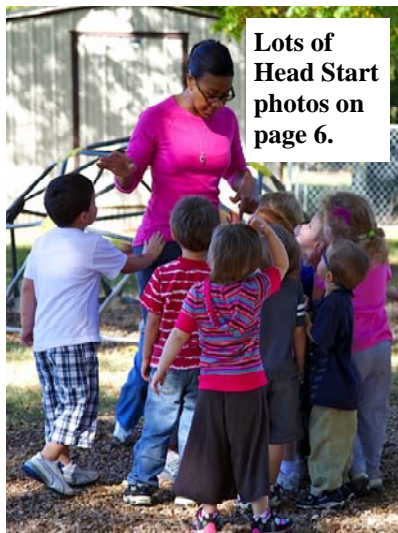
Lots of Head Start photos on page 6.